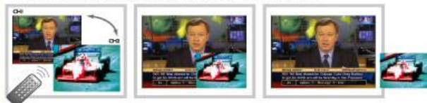
Fast Channel Switching